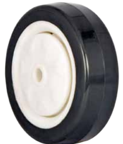
Black PU Wheel