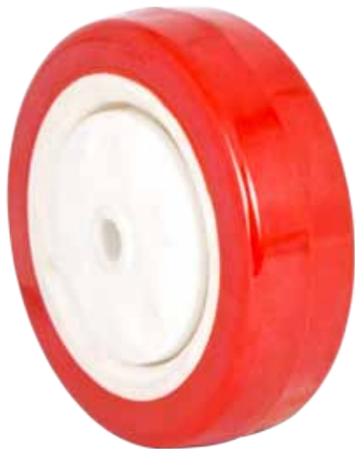
Red PU Wheel