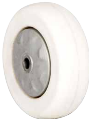
White PP Wheel